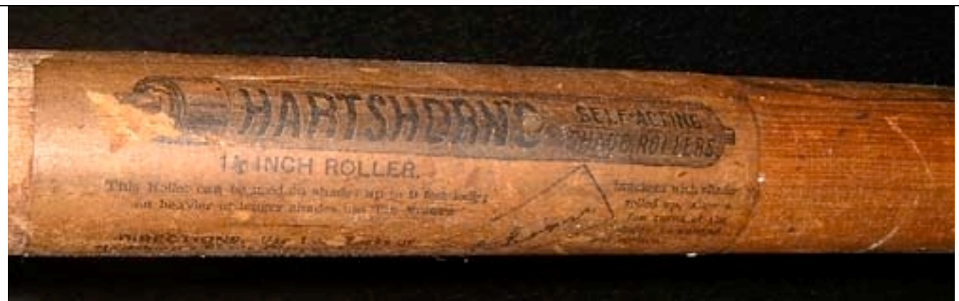
March 26, 1901, 1¼-inch model