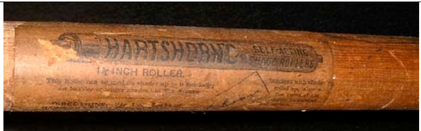
March 26, 1901, 1¼-inch model